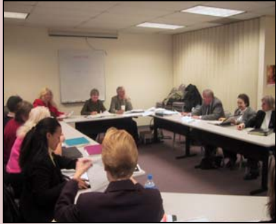
A meeting of the Calvert County Domestic Violence Fatality Review Team in 2005